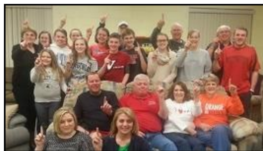
Church family gathered to cheer on the Lady Warriors!