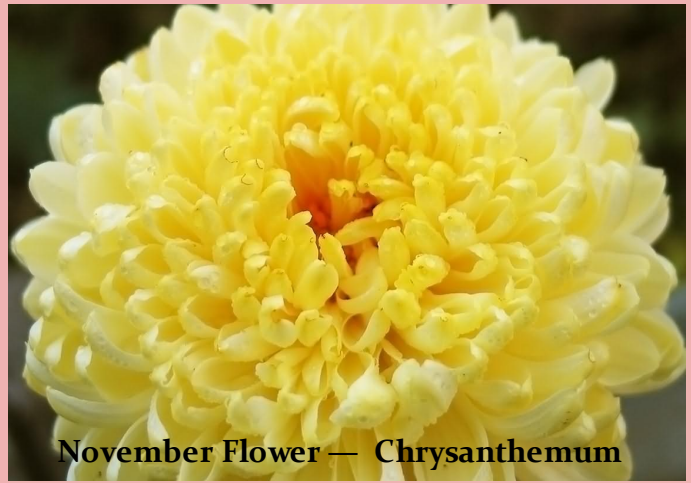
November Flower — Chrysanthemum