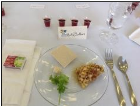
Place Setting: 4 cups, matzah, charoset, parsley, horseradish