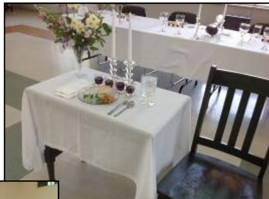
The Elijah Table