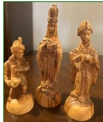
Matthew 2: 1-12