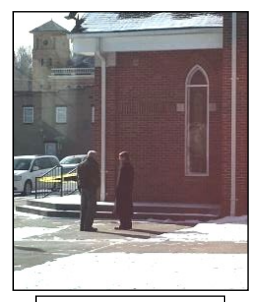
Cold outside (14 degrees!!), but warm inside!