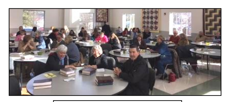
Worshipping in the Fellowship Hall