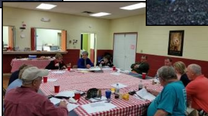
Planning for this summer's mission trip to NC.