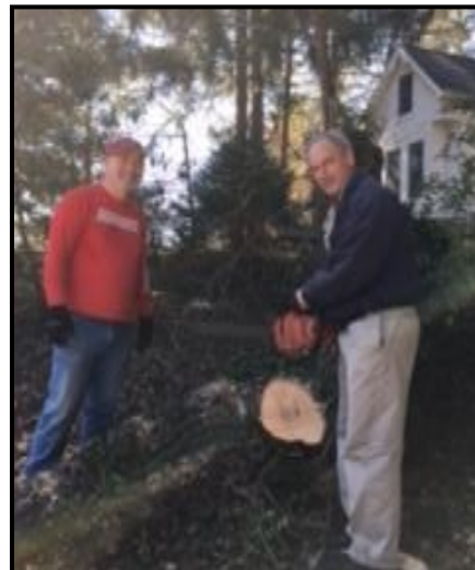
Cutting up the tree that fell in the Adrian's yard!