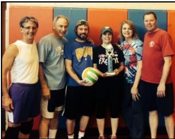
Our Co-Ed Volleyball Team took 3rd Place in the Tournament this past weekend!